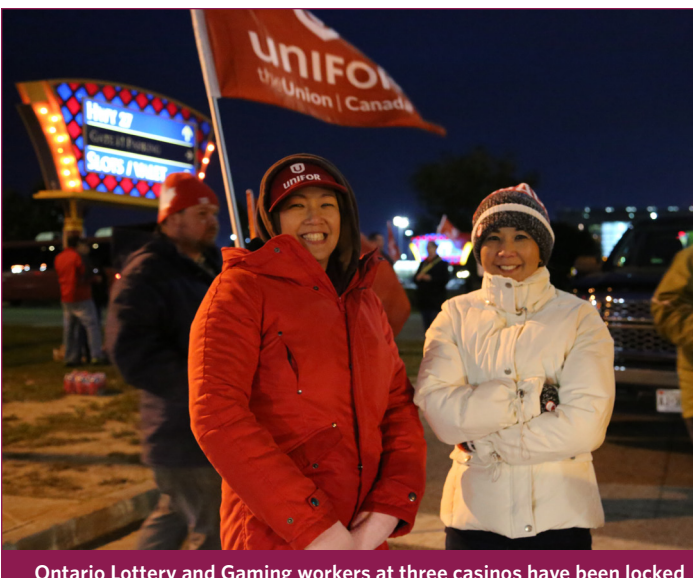
Ontario Lottery and Gaming workers at three casinos have been locked out since September 19 in a dispute over pensions.

"Wynne claims to be a champion of retirement security, yet she and her government are turning a blind eye as their privatization scheme puts that very security at risk for OLG workers," said Orr.