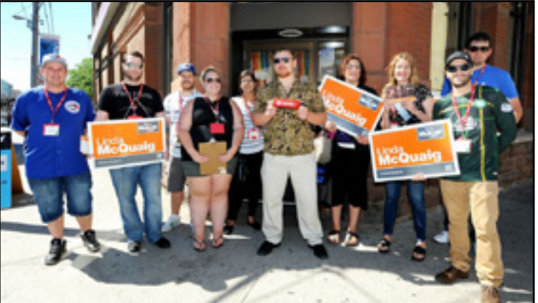
Young workers canvass during the Young Workers Seminar in August 2015, Toronto, ON

This newsletter is developed BY and FOR Unifor young workers all over the country. Our goals with this newsletter are to connect and engage young workers in the life of the union, provide you with useful information and point you to upcoming actions and events that you can go to in your community. We're glad to have you on the list - stay tuned for more updates!