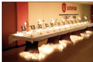
Local 302 commemorates December 6th

The violence experienced by women clearly extends to the workplace as data from the Workplace Safety and Insurance Board (WSIB) in Ontario reveals health and community workers - predominately women, were the victims of 639 approved lost-time injury claims in 2014 compared to 10 workers in construction. As health care workers, we need to collectively challenge a workplace culture that widely views violence to be an expected or normal part of our work.