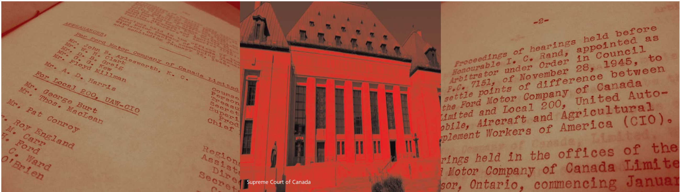
Supreme Court of Canada

It took until the late 1970s for the Rand Formula to become law in Ontario and Quebec.