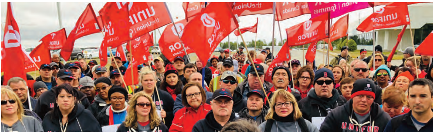
Unifor members block the entrance to D-J Composites and wave Unifor flags during a rally streamed live on Facebook.

Examples such as the Giant Mine tragedy reveal the incalculable costs of failing to have anti-scab legislation in place, which cannot be captured by studies that simply look at the incidence or duration of labour disputes. Both Unifor's experiences and those of the broader Canadian labour movement show a clear trend towards escalating tensions and potential violence when scabs are brought in by employers, as well as enduring adverse impacts on the broader community, particularly in smaller cities and towns. Based on these negative outcomes alone, anti-scab legislation should be present in every jurisdiction in Canada. One lost life is one too many, and no worker should be afraid of injury or death because an employer has decided to deploy scabs in an effort to undermine workers' rights to collectively bargain and strike.