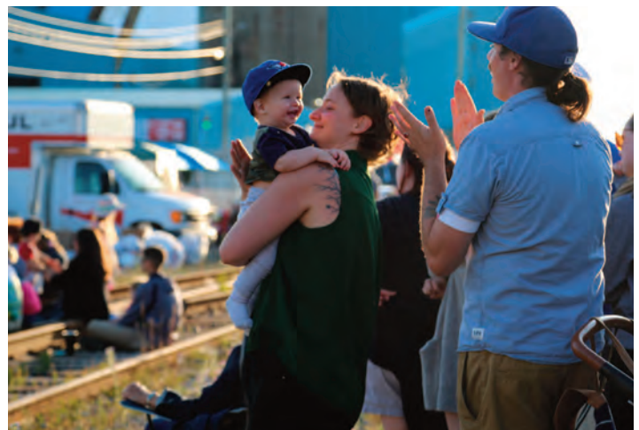
One of many family friendly events on the Goderich picket line in 2018.

For us, we were really sure there would have been some sort of serious accident at the mine. And the dispute would have been prolonged. But in terms of an accident, the fact is we were worried about the mine as a whole, and would we even have a place to go back to work? That was a serious concern that we still talk about today. These people the company had hired to come and do our jobs had no skills whatsoever and were working 12 to 16 hour days.