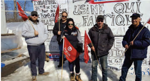
Unifor members in Grand Mere, Quebec spent 1074 days on the picket line.

In Canada, three provinces currently have or have had anti-scab legislation: Quebec, British Columbia and Ontario.