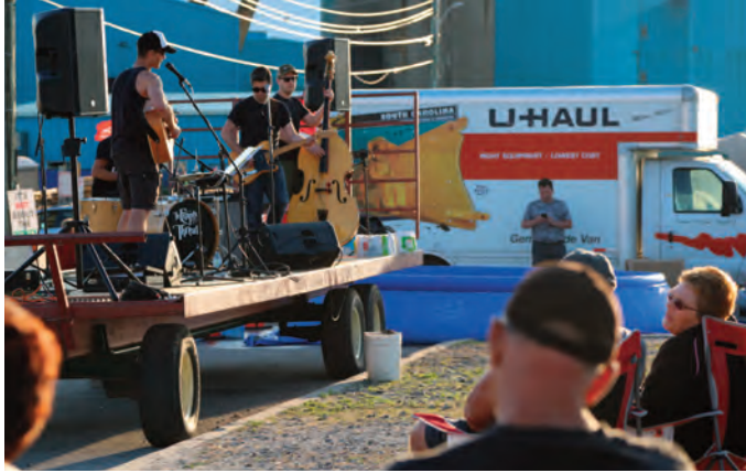
This is one of several concerts held on the picket line in Goderich to bring community member to the picket line in 2018.

Like any local union, at times we all don't agree on everything that is brought forward, whether it's from the union executive or from management. But when they do something like this, it brought our local so close together, especially when the gloom cut so deep.