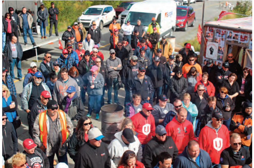
The crowd kept building as Unifor stood up to D-J Composites during a two year lockout.

However, more recent study by Duffy and Johnson (2009) used a larger data set from 1978 to 2003 to examine the impact of anti-scab legislation in Quebec, B.C. and Ontario on the frequency of work stoppages as well as their duration. In line with previous studies on the Canadian experience, they found that the incidence of work stoppages increased in the first two years after anti-scab legislation was introduced, but in contrast to these earlier studies, there was a significant and substantial reduction in the length of the work stoppages . Of all the variables they examined, including dues check-off, compulsory conciliation and mandatory strike votes, among others anti-scab legislation, along with bans on professional strike-breakers and reinstatement rights, had the most significant impact on the length of work stoppages, considerably reducing them. Notably, the authors also found that there was little to no evidence that there was any effect on days lost to work stoppages once anti-scab legislation was introduced, both in the first two years following its implementation and after it had been in effect for more than two years.