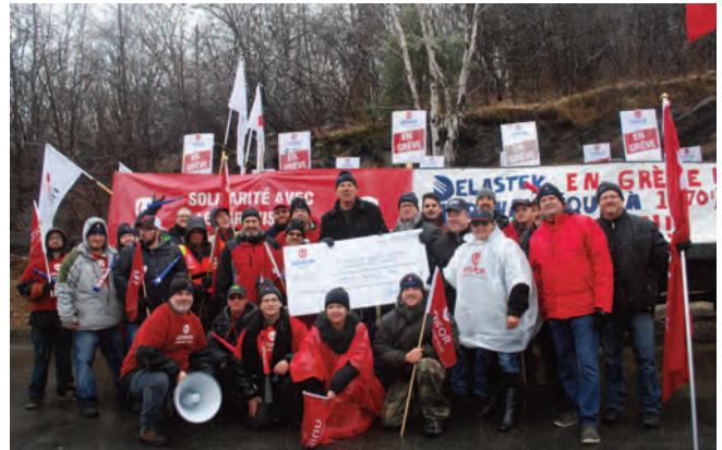
Presentation of a donation to the striking members of Local 1209 at Delastek at a solidarity demonstration in the streets of Grand-Mère, Quebec, on December 15, 2015.

We also know that beyond the numbers themselves, there are real working people out on the picket line, taking huge risks and fighting for themselves and their families. In Voices from the Picket Line , we are going to look at two real life case studies that document the experiences of Unifor members and how the use of scabs during labour disputes undermined workplace safety, increased the likelihood of conflict, dragged out disputes, and created lasting animosity that destabilizes labour relations.