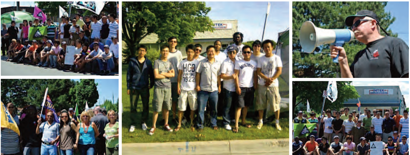
Members across Ontario at Intek Communications and DHT were locked out for 457 days in 2012.

This model of ‘social partnership’ relies on a high level of union density and collective bargaining coverage (usually in the neighbourhood of 80-90%) as well as general agreements that are negotiated between the major labour and employer federations which set baseline regulations for most employers and workers. These general agreements include provisions that set penalties for strike action undertaken while an agreement is in force. This arrangement implies that employers are free to replace striking workers during a labour dispute. In practice, however, the use of scabs in these countries is rare in the modern era, particularly since the threat of co-ordinated solidarity strikes by other unions, which strategically target an employer’s supply chains, tends to put a damper on employers’ willingness to deploy replacement workers.