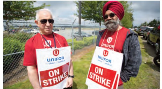
Unifor members on the picket line during the Cascade Aerospace strike in 2014.

Quebec’s anti-scabs laws effectively ban the use of any employee or contracted workers to perform the duties of a bargaining unit member, except for managers at the workplace, rendering it the most favourable to workers in the country. However, the loophole which allows managers to be deployed as scabs has been exploited by some employers to drag out disputes. This undoubtedly contributed to one of the longest labour disputes in Quebec’s history, when Delastek deployed managerial scabs to hold out against Unifor Local 1209, leading to a 35-month strike from 2015 to 2018. Likewise, workers at the ABI aluminum smelter in Bécancour, QC were locked out for 18 months from 2018 to 2019 by their employer with the help of scabs and the authorities’ failure to properly enforce anti-scab provisions. Ontario’s anti-scab legislation, now repealed, permitted the use of managers and non-bargaining unit employees as scabs, that (while limited) created an even more expansive pathway to potential disruptive labour relations during a dispute. Finally, B.C. laws – which allow all employees at the workplace to cross picket lines during a dispute – are the weakest of the three.