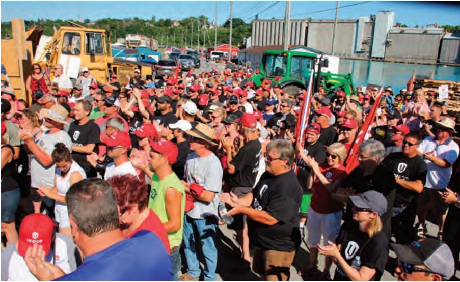
Hundreds of Unifor members traveled to a rally in support of workers at the salt mine in Goderich in 2018.

people, and still getting their product out, it's absolutely tipping the balance and the scales in the company's favour.