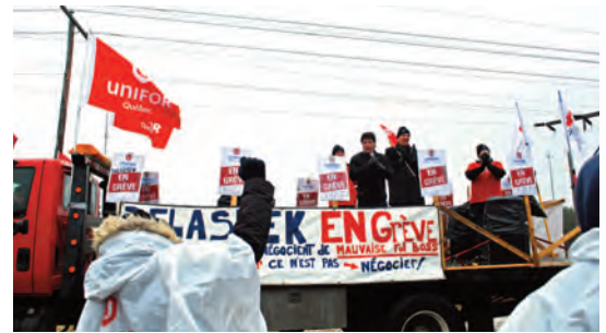
Speech by Jerry Dias at a solidarity event for Local 1209 members at Delastek on December 15, 2015.

All three provincial anti-scab laws made exceptions in the case of emergencies where health and safety are at risk or there is the risk of damage to property, machinery or the environment.