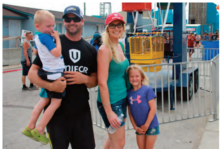
One of many families featured in a series of videos about how scabs hurt families posted during the Compass Minerals dispute.

Only about 2.1% of Unifor’s contract negotiations since 2013 have involved a strike or lockout, and employers used scabs in less than 10% of those disputes. However, it is clear that when they are involved, scabs make strikes and lockouts longer, more acrimonious, and more risky in terms of workplace health and safety. The employers’ ability to use scabs tips the balance of power too far in their favour and undermines normalized labour relations. It is time to level the playing field and pass anti-scab legislation, allowing working Canadians to bargain fair contracts that support themselves, their families and their communities.