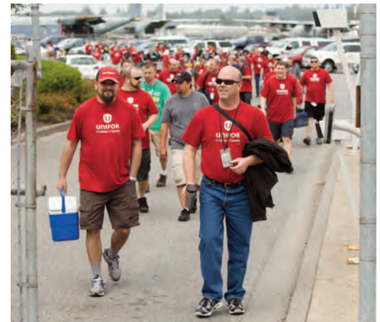
Unifor members walk off the job on day 1 of the strike at Cascade Aerospace in Abbotsford, B.C.

Section 68 (1993) of British Columbia's Labour Relations Code prohibits employers from using scabs who are new hires (i.e. after notice to commence collective bargaining has been given), employees who ordinarily work at another place of operations or who have been recently transferred, or externally contracted workers. Unlike in Quebec, B.C. anti-scab rules permit an employer to use scabs when they are existing members of the bargaining unit or they are employees, working in the establishment and hired prior to the commencement of collective bargaining (e.g. managers). The only restriction is that employers cannot compel or coerce an employee into performing any or all of the work of a bargaining member unit while on strike or lockout. 2