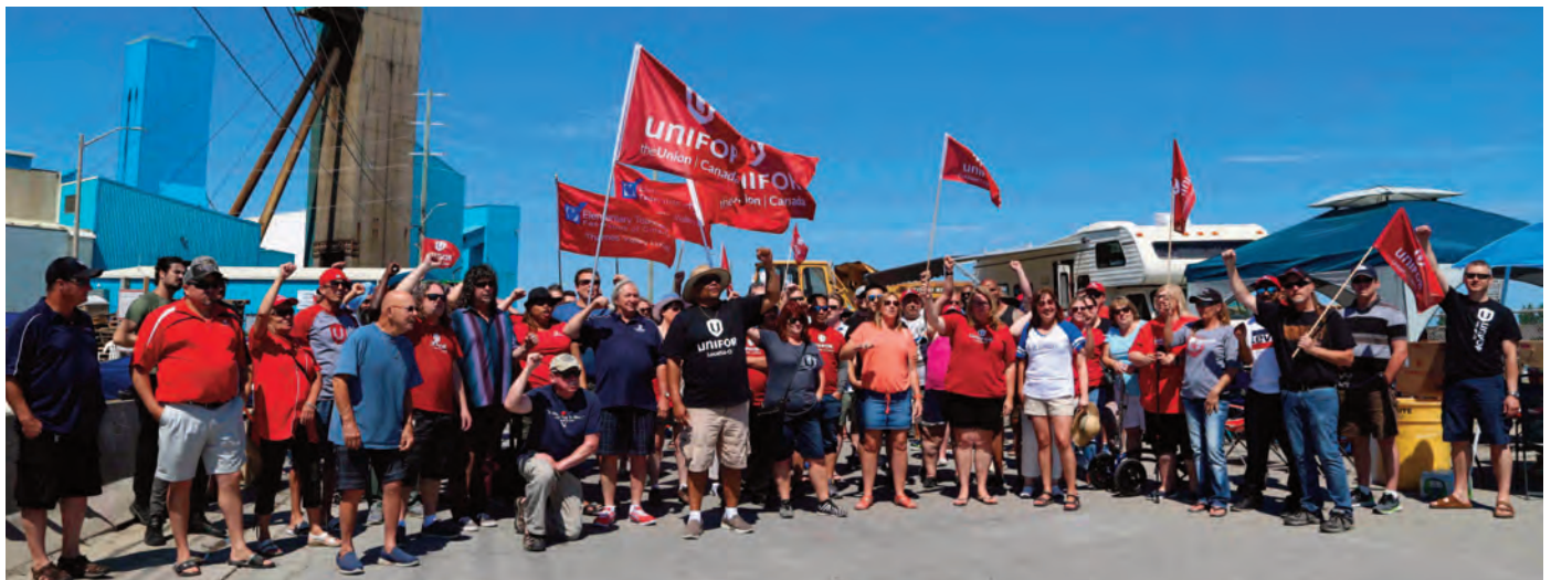
Members from across Ontario mobilized to support members of Local 16-0 in Goderich, Ontario in the summer of 2018.