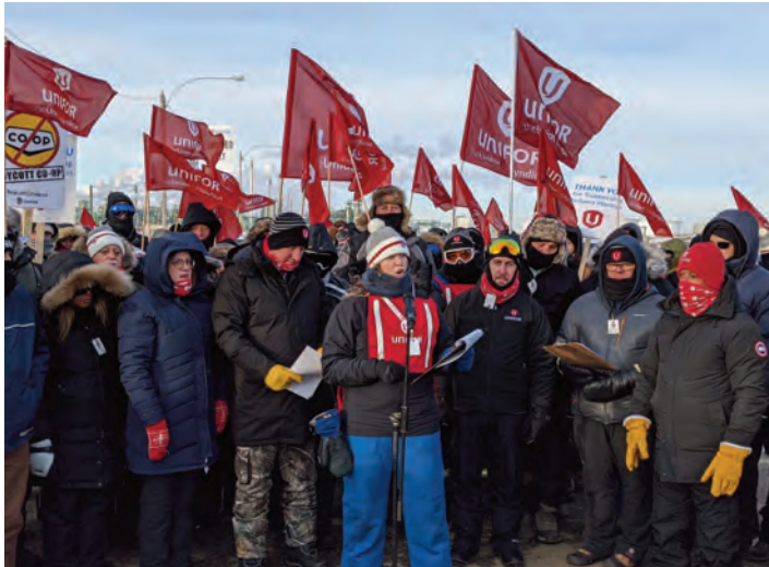
Unifor members from across Canada helped to bolster the picket lines at the Co-op Refinery lock-out.

So many families were impacted by this, freezing out on the picket line and looking up and seeing that helicopter. It was awful from the first day we saw those helicopters fly in. Watching them continue to fly in all day, every day. They would make low passes, I'm sure intentionally just for the psychological impact it would have on all of us. And the flight paths took them around the city, making sure that a massive percentage of the membership and everyone else in Regina was very aware of the helicopters and what was going on.