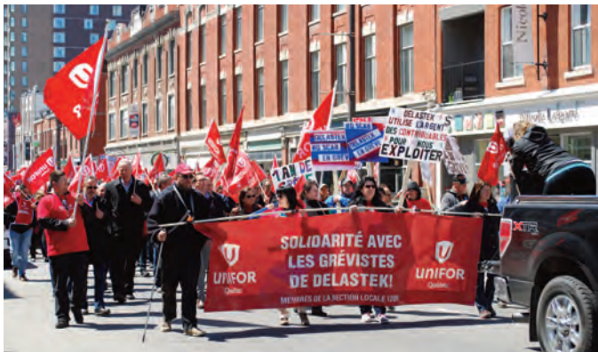
Walk in solidarity with the members of Local 1209 at Delastek in the streets of Trois-Rivières during Quebec Council on May 5, 2016.

In Spain, labour statutes do not regulate the use of replacement workers. Rather, the prohibition of scabs is by royal decree. This dates back to 1977 (RDL 17-1977, Article 6), wherein the decree specifies that, "As long as the strike lasts, the employer may not replace the strikers with workers