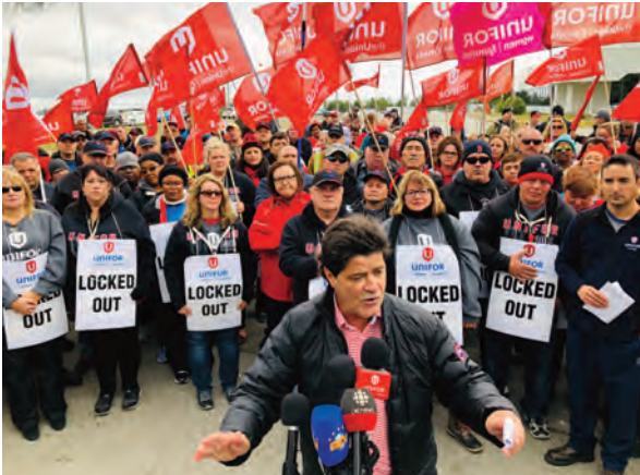
Jerry Dias tells locked out D-J Composite workers scabs are not crossing a Unifor picket line again.

At our National Convention in August 2019, more than a thousand Unifor delegates endorsed a resolution to undertake a national campaign to fight for anti-scab legislation in Canada. This resolution was proposed by Unifor Local 597, whose members working at DJ Composites in Gander, NL were locked out for 740 days – the second longest labour dispute in Unifor’s history. As noted above, the three longest disputes in Unifor’s history involved the use of scabs, a fact that speaks for itself when considering what effect scabs can have on the duration of labour disputes, and on the overall state of labour relations between workers and their employers.