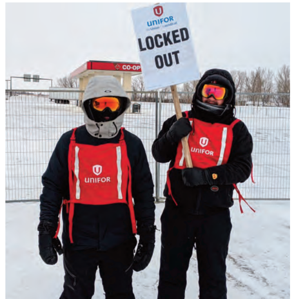
Members of Unifor Local 594 were forced to endure a longer lock-out in frigid conditions thanks to replacement workers.

The use of scabs tips the balance of power, and it really left us without many options. Local 594 is supposed to be their sole provider of labour. But with us locked out and their ability to replace us with replacement workers, it really took away the only leverage that we had. So we were kind of trapped out on the line. The company was not willing to bargain because they didn't feel any need to do that, as they were able to run the plant with their scabs and without us.