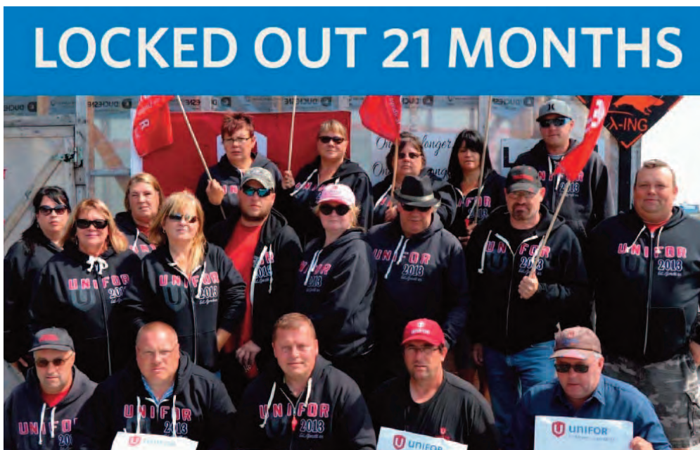
This Billboard was part of the campaign to end the D-J Composites Lockout.

This is a key finding. It suggests that once workers' bargaining power is restored through anti-scab legislation, there may be a slight uptick in the incidence of work stoppages (particularly in the first two years after legislation is introduced) but the length of the average labour dispute shortens significantly so that there is no overall increase in the number of days lost.