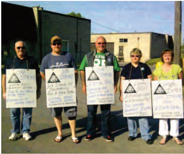
Members across Ontario at Intek Communications and DHT were locked out for 457 days in 2012.

Although empirical studies are important to get a sense of whether there are any discernable effects of anti-scab legislation on aggregate statistics such as the number and duration of labour disputes, the studies cited above suffer from a number of issues that limit our ability to draw meaningful conclusions about the importance of anti-scab legislation. For one, their sample size is often limited to a small number of jurisdictions and disputes involving large bargaining units (typically more than 500 members), which means that they are drawing on a relatively small pool of data that is subject to a large number of external variables which might be causing the observed effects.