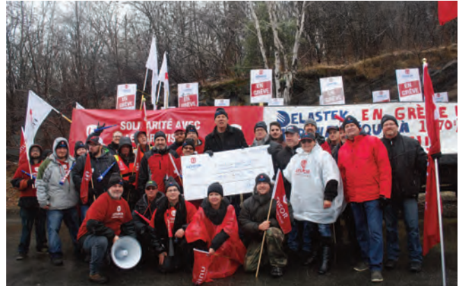
Presentation of a donation to the striking members of Local 1209 at Delastek at a solidarity demonstration in the streets of Grand-Mère, Quebec, on December 15, 2015.

We also know that beyond the numbers themselves, there are real working people out on the picket line, taking huge risks and fighting for themselves and their families. In Voices from the Picket Line , we are going to look at two real life case studies that document the experiences of Unifor members and how the use of scabs during labour disputes undermined workplace safety, increased the likelihood of conflict, dragged out disputes, and created lasting animosity that destabilizes labour relations.