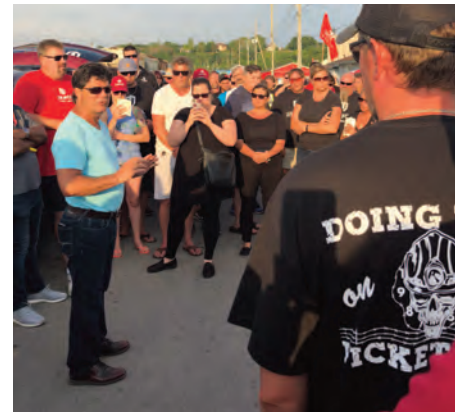
Jerry Dias addresses members of Local 16-O in Goderich on July 5, 2018 after escorting scabs off the property.

It seems like they don't want to bargain fairly, and it just prolongs the dispute. In our work culture, being in an underground mine, the integrity of the mine – our workplace – it's all impacted. And when we got to go back down there, we didn't know what we'd find heading in – there's ground control that we know was probably