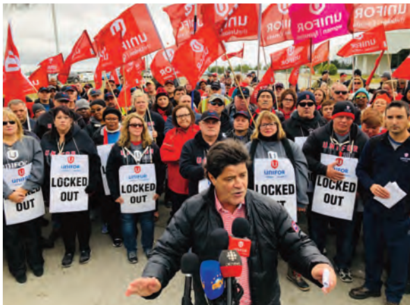
Jerry Dias tells locked out D-J Composite workers scabs are not crossing a Unifor picket line again.

At our National Convention in August 2019, more than a thousand Unifor delegates endorsed a resolution to undertake a national campaign to fight for anti-scab legislation in Canada. This resolution was proposed by Unifor Local 597, whose members working at DJ Composites in Gander, NL were locked out for 740 days – the second longest labour dispute in Unifor’s history. As noted above, the three longest disputes in Unifor’s history involved the use of scabs, a fact that speaks for itself when considering what effect scabs can have on the duration of labour disputes, and on the overall state of labour relations between workers and their employers.